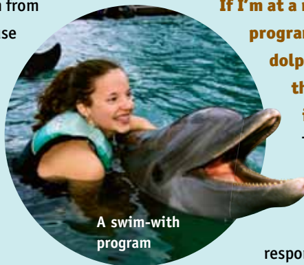
A swim-with program

The best advice is to go on a park’s or aquarium’s website and see if it is an accredited member of the Alliance or another responsible organization.